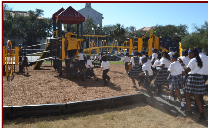
Pierre Capdau Charter School second graders stream onto their new playground for the first time following the ribbon cutting ceremony.