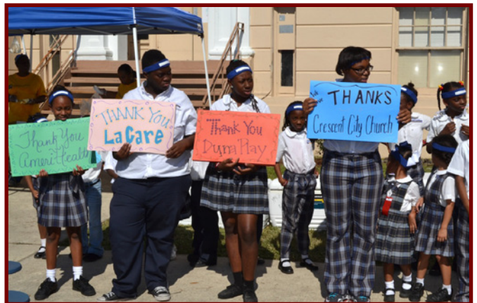
Students say "thank you" to providers of new playground, fitness center and basketball courts.

New Beginnings photo gallery: http://bit.ly/TkaTY9