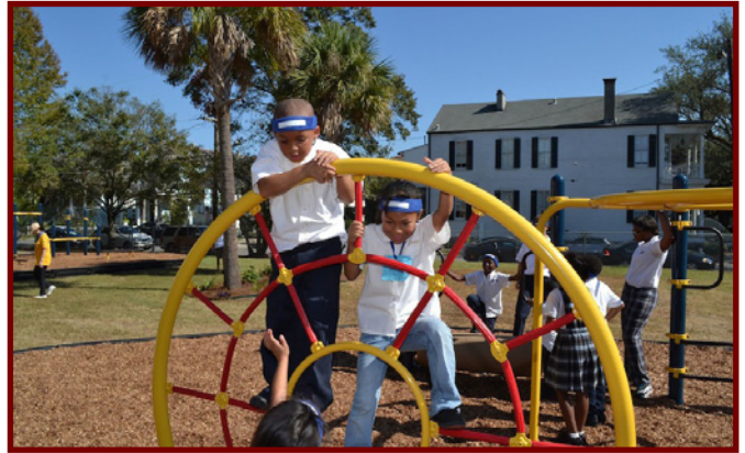
Pierre Capdau Charter School second graders give a passing grade to new playground equipment.